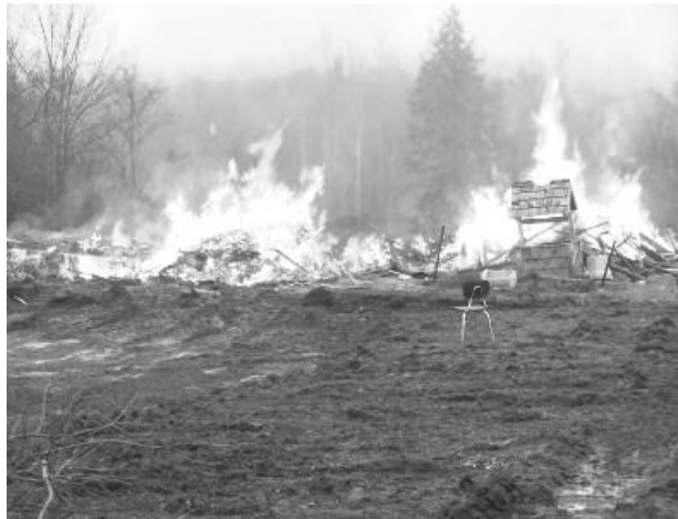
One Hot Subdivision The old Beal home burned in order to make room for the Beal Estates Subdivision on Douglas Highway