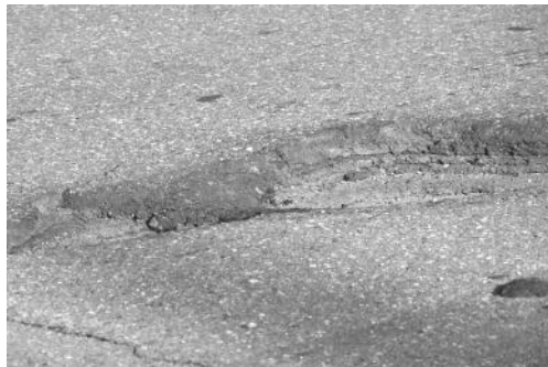
The potholes that have developed on Route 184 show the layers of pavement that have gone on the top over the years

The town complained loudly to the MDOT during the winter and spring, which prompted Commissioner David Cole to ride the road. Instead of a light resurface similar to the Lamoine Beach Road section done this year, the DOT decided to place a heavy shim of the recycled pavement down first to smooth out the heavily rutted, cracked and potholed surface, then put a surface coat