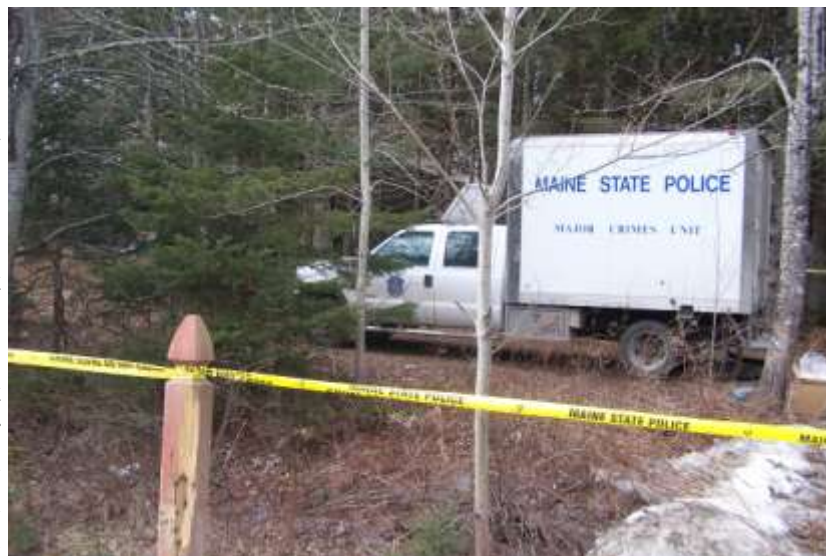
Crime scene tape isolates the property at 749 Douglas Highway while the Maine State Police Major Crimes Unit conducted the search of the property following the March 11, 2012 multiple shooting incident.

police or Hancock County Sheriff's Department will respond. The shootings show, "It can happen here".