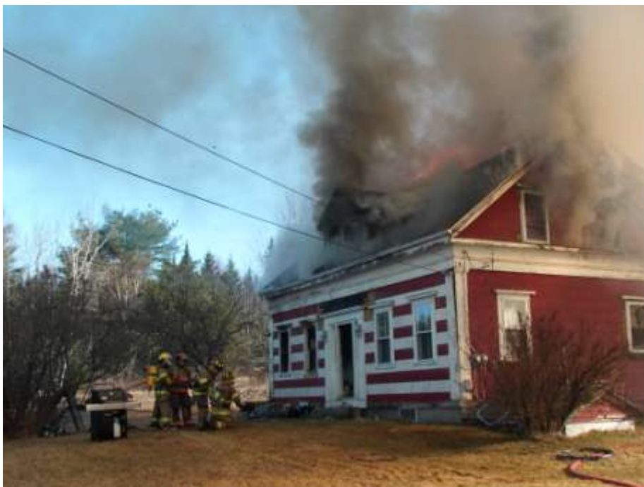
Historic House Lost to Fire

The old Zerrien House, one of the more photographed in town, was lost to fire on March 19th. Details of the fire and the response are contained on page 2.