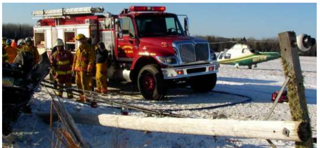
The Life Flight helicopter awaits a patient involved in a rollover accident on Pinkhams Flats in mid-February.

On February 12th firefighters, an ambulance, the Sheriff's Department and the Life