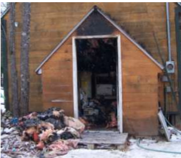
Some scorched insulation and wood damage inside a storage room remained after firefighters extinguished a blaze on Misty Way in late January.

A stubborn chimney fire on Lamoine Beach Road on March 10th brought three fire trucks to the scene down the very bumpy road on a Saturday afternoon. A clogged chimney was found, and dry chemical was able to put the fire out. Firefighters removed the flaming logs from a wood stove and extinguished them outside. There was relatively minor smoke damage, but the occupants were advised to have a professional clean and check the chimney.