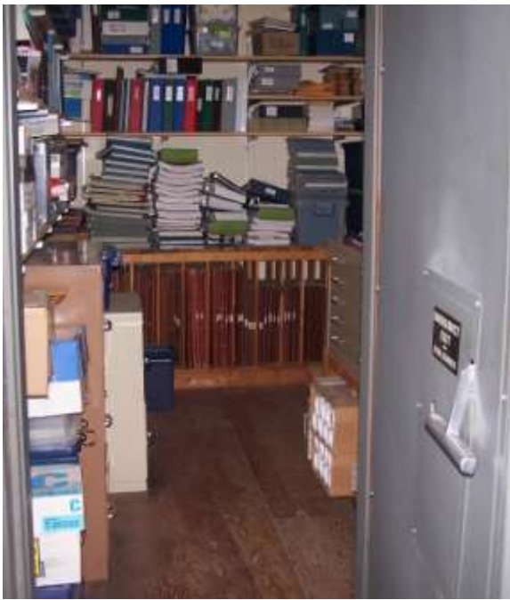
Lamoine's vault stores a lot more than the town's permanent records, and space has become a critical matter.