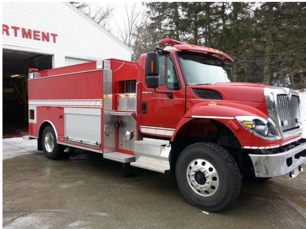
The New Lamoine 402 arrived at the Lamoine Fire Station on March 15th.

(Lamoine) - The newest member of the Lamoine Volunteer Fire Department fleet will be in service shortly—the crew is just waiting for the paint to dry—literally. A 2014 International chassis holds an 1,800 gallon water tank and a 1,000 gallon per minute pump, giving the town a second