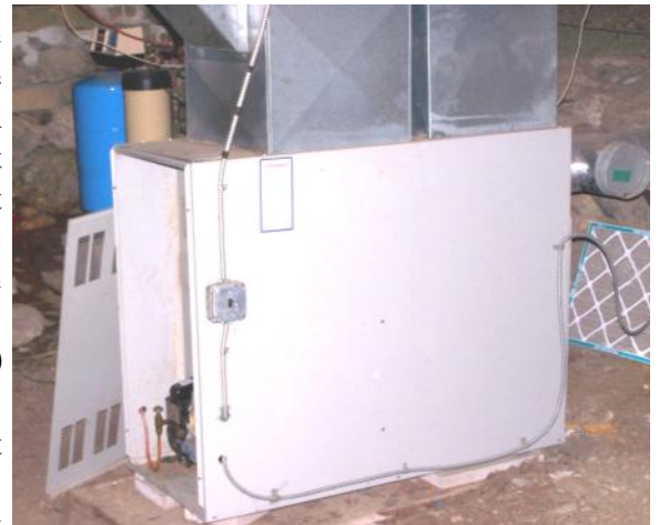
The furnace in the dirt basement at the Lamoine Town Hall is about 25-years old and has failed on an increasing frequency the past few winters.

The heating system project provides an opportunity for the town to potentially save some operating costs in the future. The budget committee has recommended using $10,000 from the Allen and Leurene Hodgkins Fund to replace the current hot air furnace system which has repeatedly failed over the past few years (often on the coldest days!). If approved, the Selectmen will explore alternate options to oil heat for the building. Possibilities include propane or