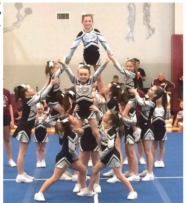
Champs for 2014 The Lamoine Pee Wee cheering squad again places 1st in a statewide competition