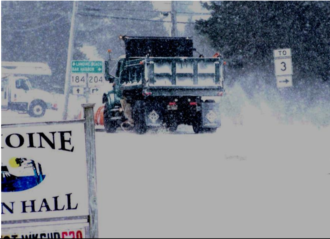
Ahhh....Springtime in Maine.

There were no prolonged warm spells to speak of, and that sucked up the heating fuel at the fire station and town hall. The town generally budgets 1,500 gallons of fuel at the fire house—that was exhausted in early March, thanks in part to the cold and in part to a rash of calls in late December that saw the trucks exit and enter the station numerous times, allowing the warm air to escape.