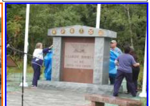
Committee members unveil the monument at the dedication