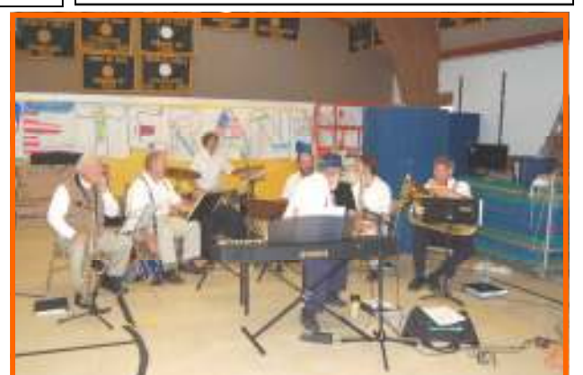
At the reception following, the Fletcher's Landing Philharmonic provides music