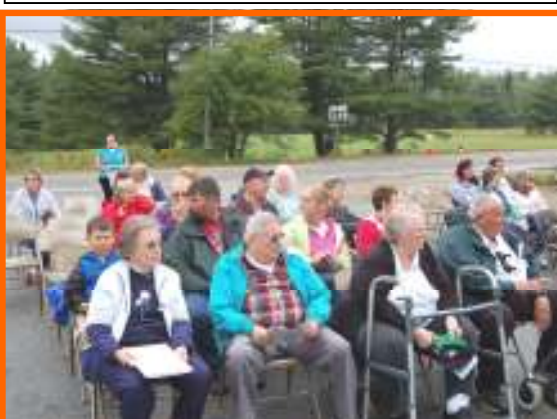
The crowd gets into place for the dedication ceremony September 13, 2008