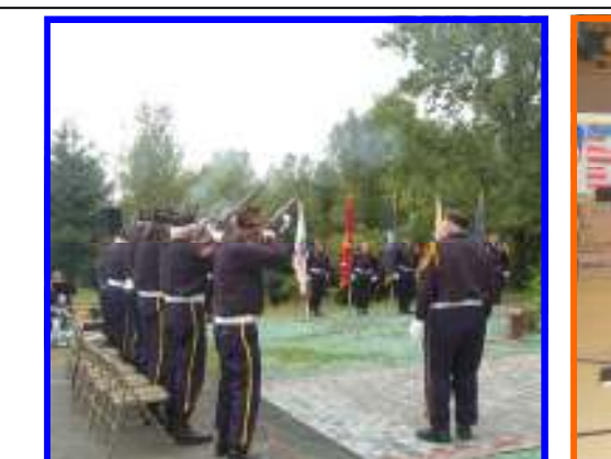
The Ellsworth VFW Color Guard salutes the memorial