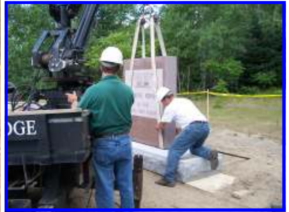
The crew from Wieninger's Monuments sets the main stone in place