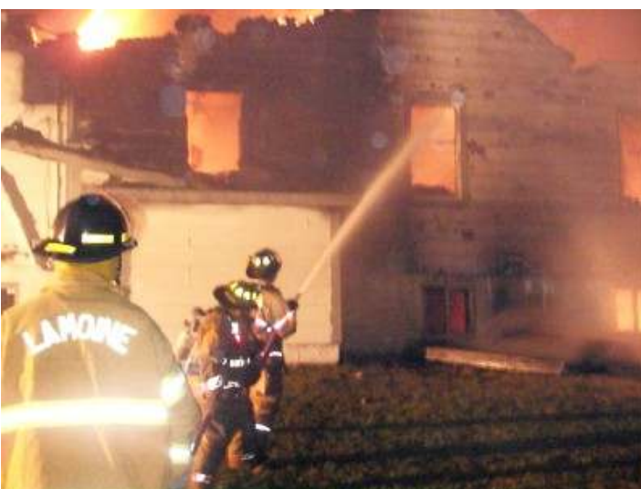
The Lamoine VFD crew played a major role in extinguishing a fire that destroyed the Church of Life and Praise in Ellsworth in July

(Lamoine) - It took a little longer than desired, but a building that was condemned as dangerous by the Board of Selectmen has been removed from Berry Cove Road by its owner. Neighbors complained in 2007 that the unused cabin was open to the weather and attracting animals and was not fit to inhabit. A subsequent inspection by the Code Enforcement Officer confirmed the observation and Selectmen held a hearing at which the owners did not appear. Selectmen ordered removal, the town attorney successfully convinced the owner to do so after the deadline expired.