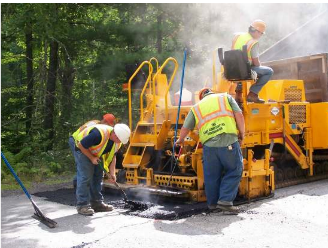
The crew from Lane Construction begins paving Walker Road

After considering the options, Selectmen offered to increase the contract price to half of the estimated increase Lane had in asphalt costs and the thin out the mix a bit on Walker Road. Lane agreed to the new price at about $90/ton, still significantly lower than towns not using the PMS system. Walker Road, Birchlawn Drive and South Birchlawn Drive got new coats of pavement in August.