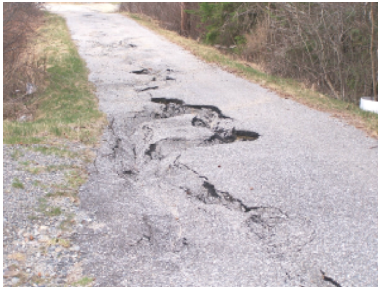
Cos Cob Avenue was rendered impassible after the Patriots' Day Storm

(Lamoine) - The Federal Emergency Management Agency (FEMA) has outlined just over $33,000 in emergency road repairs needed due to the various winter and spring storms in 2007. The town will receive 75% of the funding for the outlined repairs once they are done.