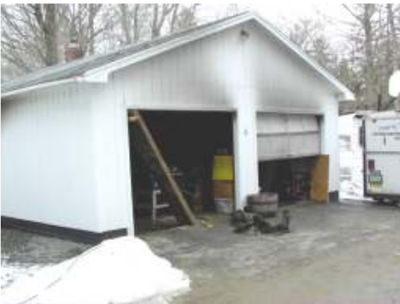
The aftermath of a garage fire on Mud Creek Road. The homeowner has since had the damage repaired.

Lamoine and Hancock firefighters quickly controlled the first structure fire in several years in town—saving a burning garage on Mud Creek Road. When the call came in, Lamoine's lead pumper was stationed for training at the Franklin Fire Department, while Hancock had a crew right around the corner from Mud Creek Road preparing for a controlled burn. Both departments were on scene in less than 10-minutes and quickly extinguished the flames. Combustibles too close to a wood stove caused the fire.