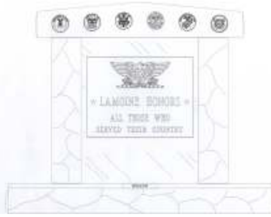
Proposed Monument The drawing by Weiniger Monuments of Milbridge shows what the proposed monument at the town hall would look like