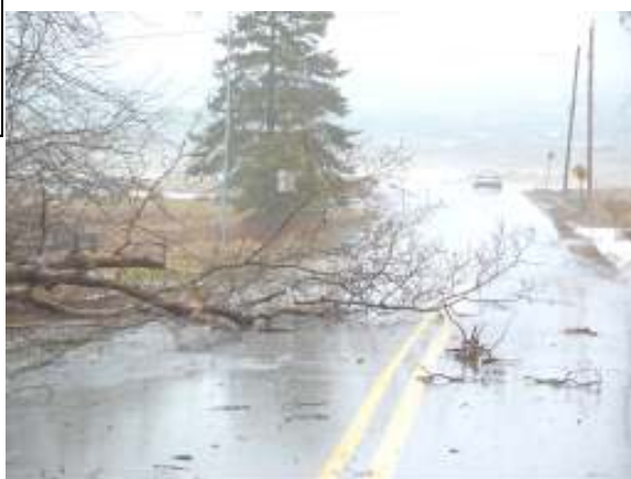
The Patriot's Day storm brought down numerous trees in roads. Surf at Lamoine Beach (in background) was spectacular.

Firefighters stood by the scene of a burning utility pole on Buttermilk Road for an hour on Memorial Day waiting for Bangor Hydro (located around the corner) to arrive and fix a broken insulator.