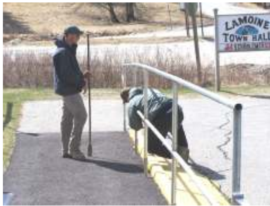
Workers from ADA Fence Company install a railing along the access ramp to the town hall.

(Lamoine) - A newly painted parking stall for folks with disabilities and a new hand rail along the ramp leading into the town hall put the finishing touches on the effort to improve accessibility to the town hall. The Secretary of State's office studied the entrance in 2006 and made a list of suggested improvements, and paid the town $2,642.00 for the work that was done. The improvements were in place for the June 12, 2007 election.