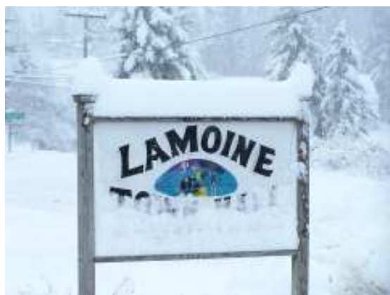
April Showers Bring..... Snow Shovels! Maine got it's biggest snowfall of the winter in the Spring on April 7th. A foot of snow coated the ground.

The town submitted claim forms to the Hancock County Emergency Management Agency which in turn won a state disaster declaration. Officials from the Federal Emergency Management Agency have visited town on two occasions to look over the damage. The town should get some reimbursement for the emergency repairs performed by local contractors to try to get the roads passable.